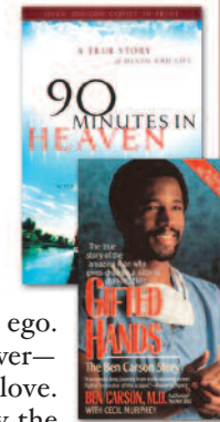
Chart Toppers: Murphey's work includes several bestsellers.